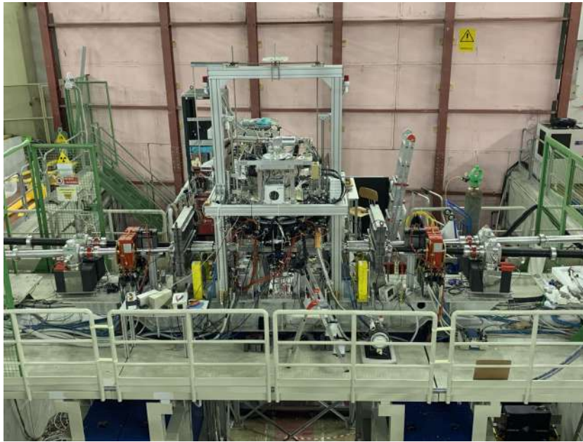
Figure 2: Picture of the SIDDHARTA-2 experiment presently installed in the DAΦNE \Phi factory, at the National Laboratories of Frascati (LNF-INFN), in Italy.